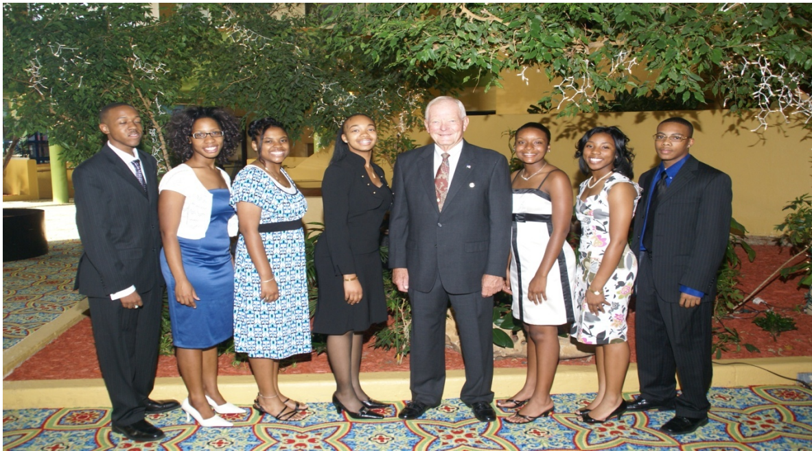
2008 Scholars with Mayor Waddle at the Awards Banquet