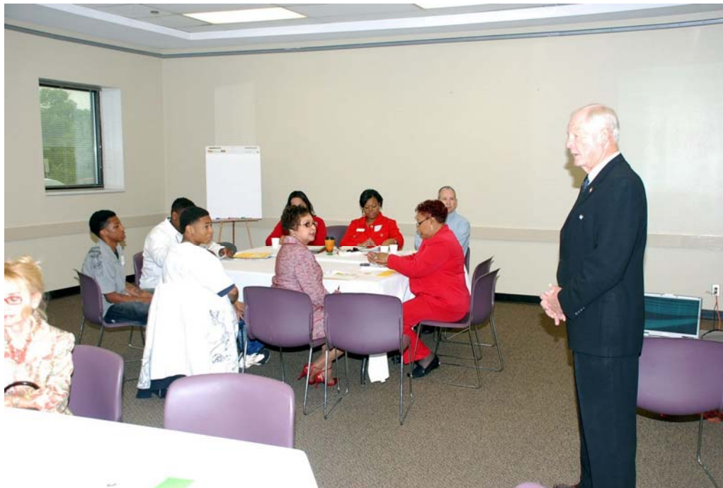
Mayor Waddle addresses community leaders assembled for first symposium meeting.

CDC is working in partnership with the City of DeSoto and the Administration for Children and Families (ACF) to develop a community symposium on Youth. The goal of the symposium is to coordinate resources available to Youth and encourage them to their brightest future as productive citizens.